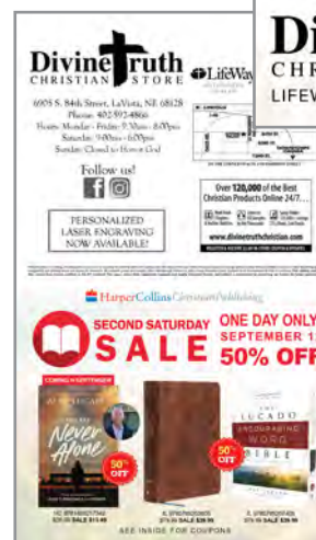
Sample inside cover