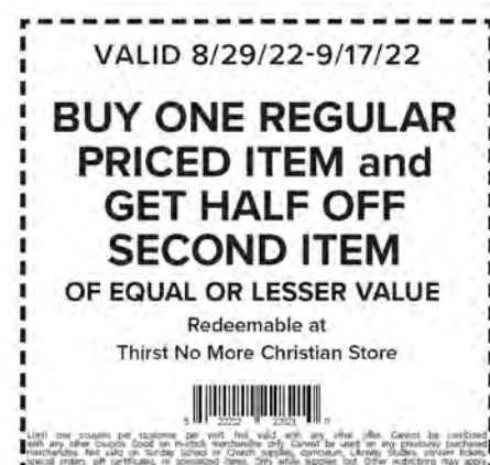
Sample customized coupon